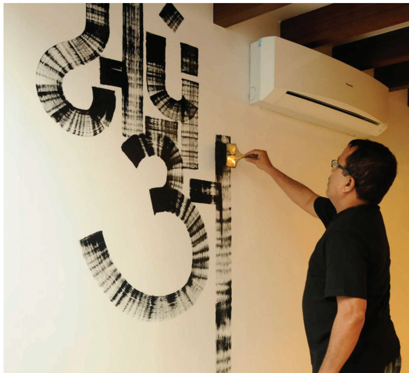
Experimentation in Calligraphy