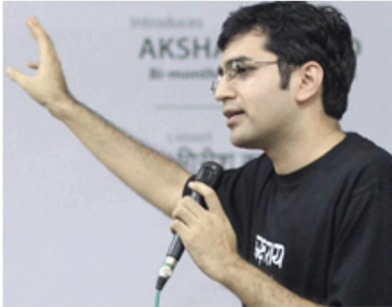
Indigenous Open Font Design