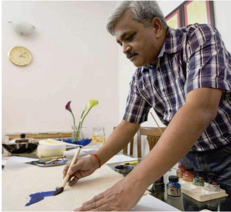
Innovations in Calligraphy