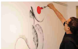
Achyut Pallav Eminent Calligrapher