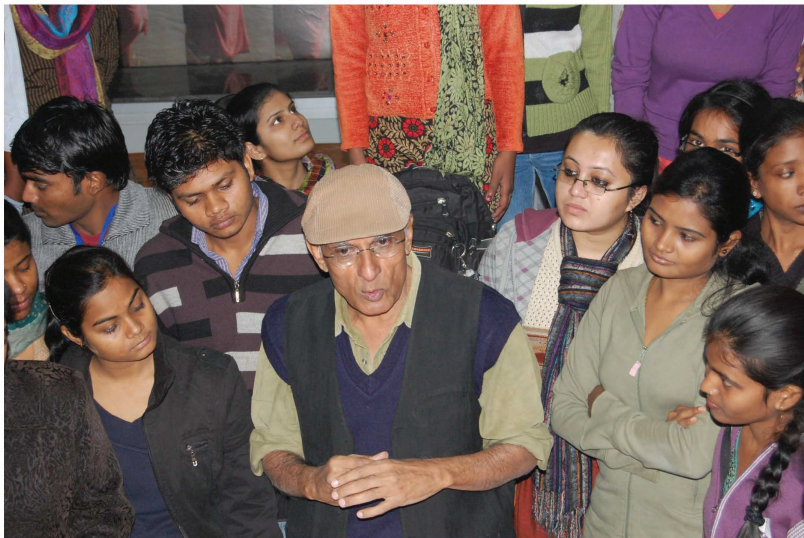
Letter Form Exploration